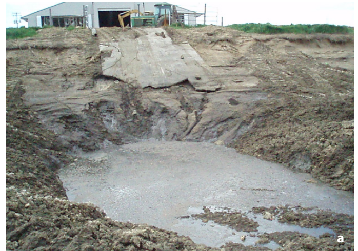
Figure 3. Erosion of an earthen manure storage.

Tractor-driven systems include high-capacity pumps, inclined shaft propeller-type agitators, inclined-shaft centrifugal agitators and chopper-agitator pumps. To be effective, these tractor-driven agitation devices should be able to move manure in the center and edges of the manure storage well enough to suspend the solids that concentrate in these areas. It is recommended to operate the agitation equipment every 100 feet, which is the average reaching distance for this type of equipment (Fulhage and Pfof 2000).