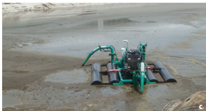
Figure 2. Types of agitators: a) pump, b) propeller, and c) boat.

agitation are either driven by tractor power takeoff (PTO) or remotely controlled boats (Figure 2).